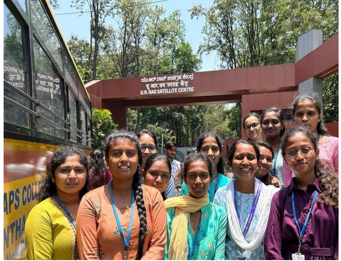
Indian Space Research Organization (ISRO). It was a part-operational, part experimental mission to

11.An Industrial visit was arranged by Department of ECE for 4<sup>th</sup> and 6<sup>th</sup> semester students on 18<sup>th</sup>April 2023. 35 Students accompanied with 3 faculty members visited UR Rao Satellite Center (URSC), Bengaluru (Formerly known as ISRO Satellite Center (ISAC). ISRO Satellite Center (1SAC) is the lead center of the Indian Space Research Organization (ISRO) responsible for design, development, assembly & integration of communication, navigation, remote sensing, scientific and small satellite missions. It was arranged for the benefit of students by exploring the space exhibition center at ISAC. Scientist explained each and every display unit kept for the exhibition. It includes the models of the first Indian satellite Aryabhatta, APPLE, INSAT series etc. Satellites are basically of two types- Indian Remote Sensing (IRS) satellites and communication satellites. IRS-1A was the first remote sensing mission undertaken by the