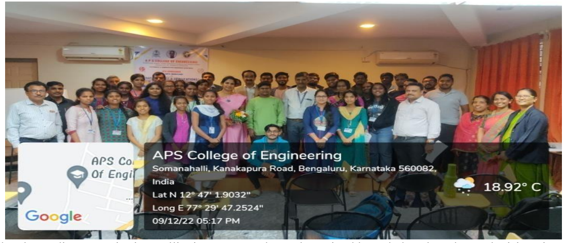
develop Indian expertise in satellite imagery. Students also gained knowledge about how television signals are broadcasted with the help of satellites. A working model was demonstrated. Various images of India taken at different angles from the satellites, for the purpose of geographical/weather study were seen. Different electronic devices used in satellite and space communication were explained. The 'clean room' concept for assembling of satellites was shown during the same. It was a great experience for the students. The Industrial Visit was a great benefit for the students to directly understand about the various concepts of satellite and space missions done by ISRO.

12. The Department of ECE through its forum "Elektronika" Organized a one day Student Development Program on